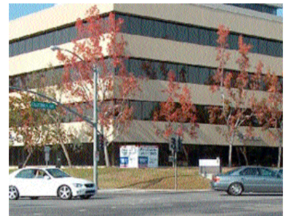
PLNU Bakersfield quadrupled its capacity with its move to this new location at 5080 California Avenue.