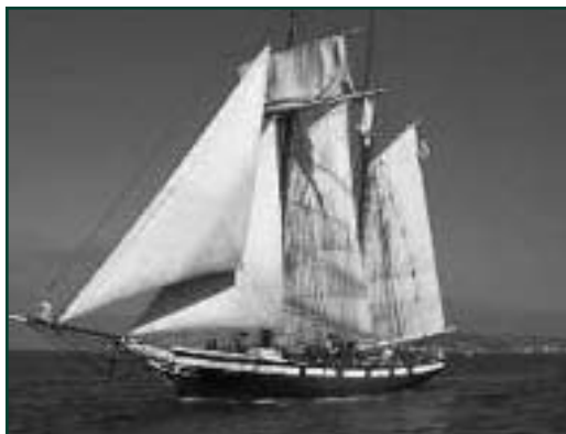
The Californian, the official tall ship of California.