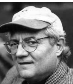
Roy Blount, Jr.