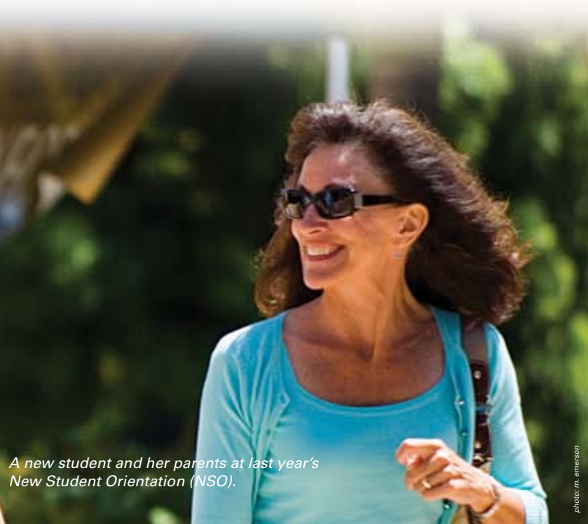
A new student and her parents at last year’s New Student Orientation (NSO).